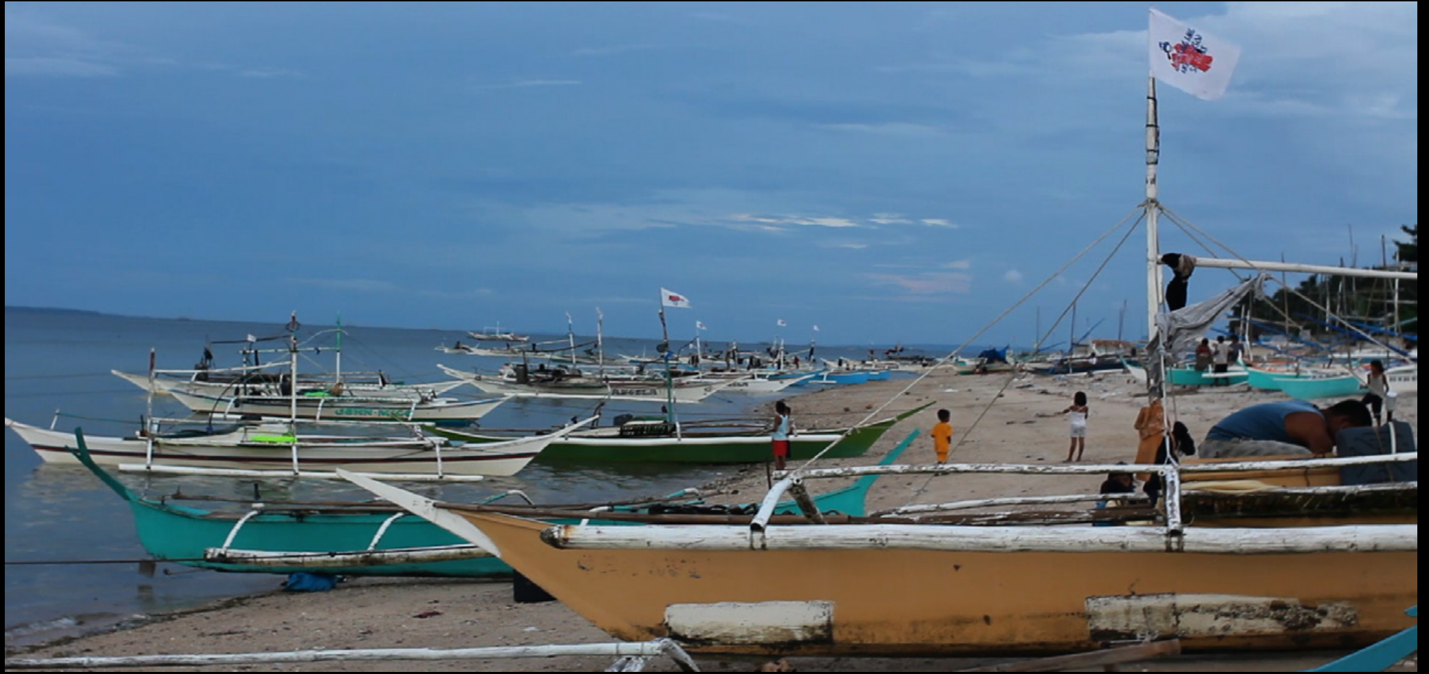
the logo on fabric were turned into flags by the fishermen of madridejos, bantayan. the flags became a symbol of pride.