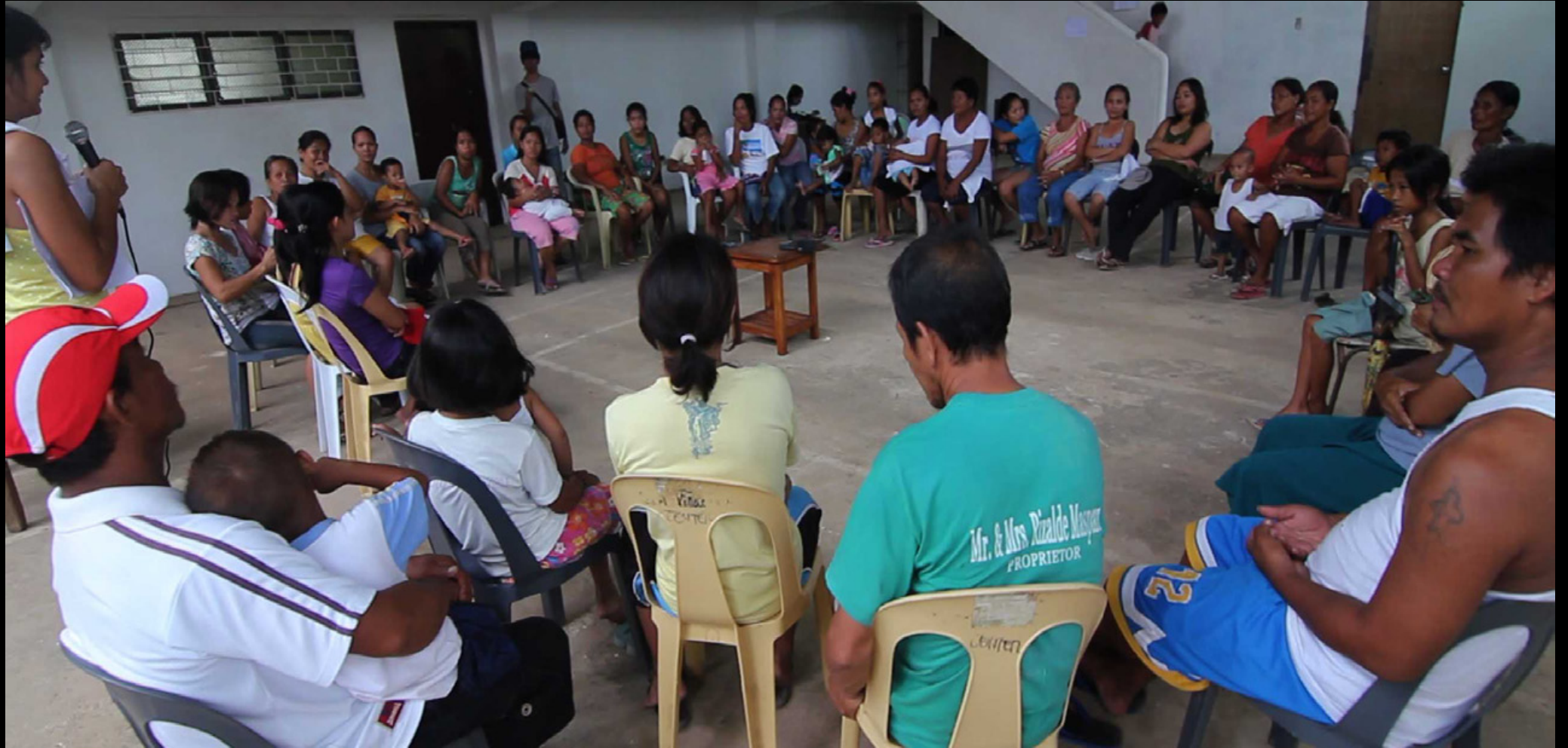
talks with the local fishermen and their families. one of many gatherings prior to the final installation.