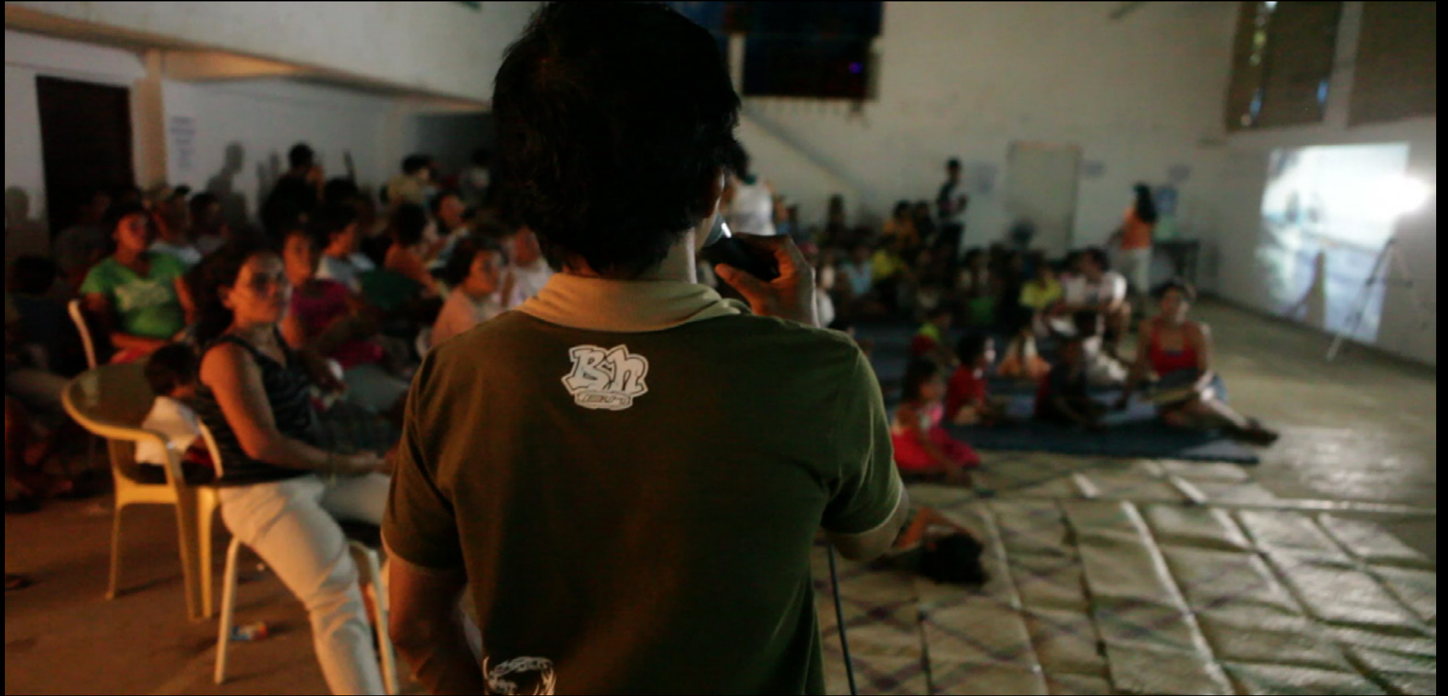
dialogues during the final installation. an international sefarer talks about the issues facing them.