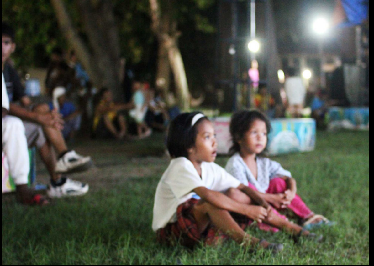
left fishermen and their families at the final screenings